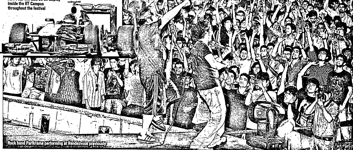
Rock band Parikrama performing at Rendezvous previously

An F1 car will also be on display inside the IIT Campus throughout the festival