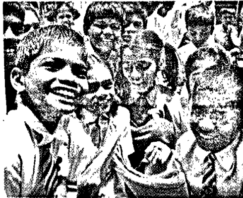
Inter-state differences have narrowed, especially so for education

But its conclusion on hunger and therefore malnutrition are stark. The report notes that just asking